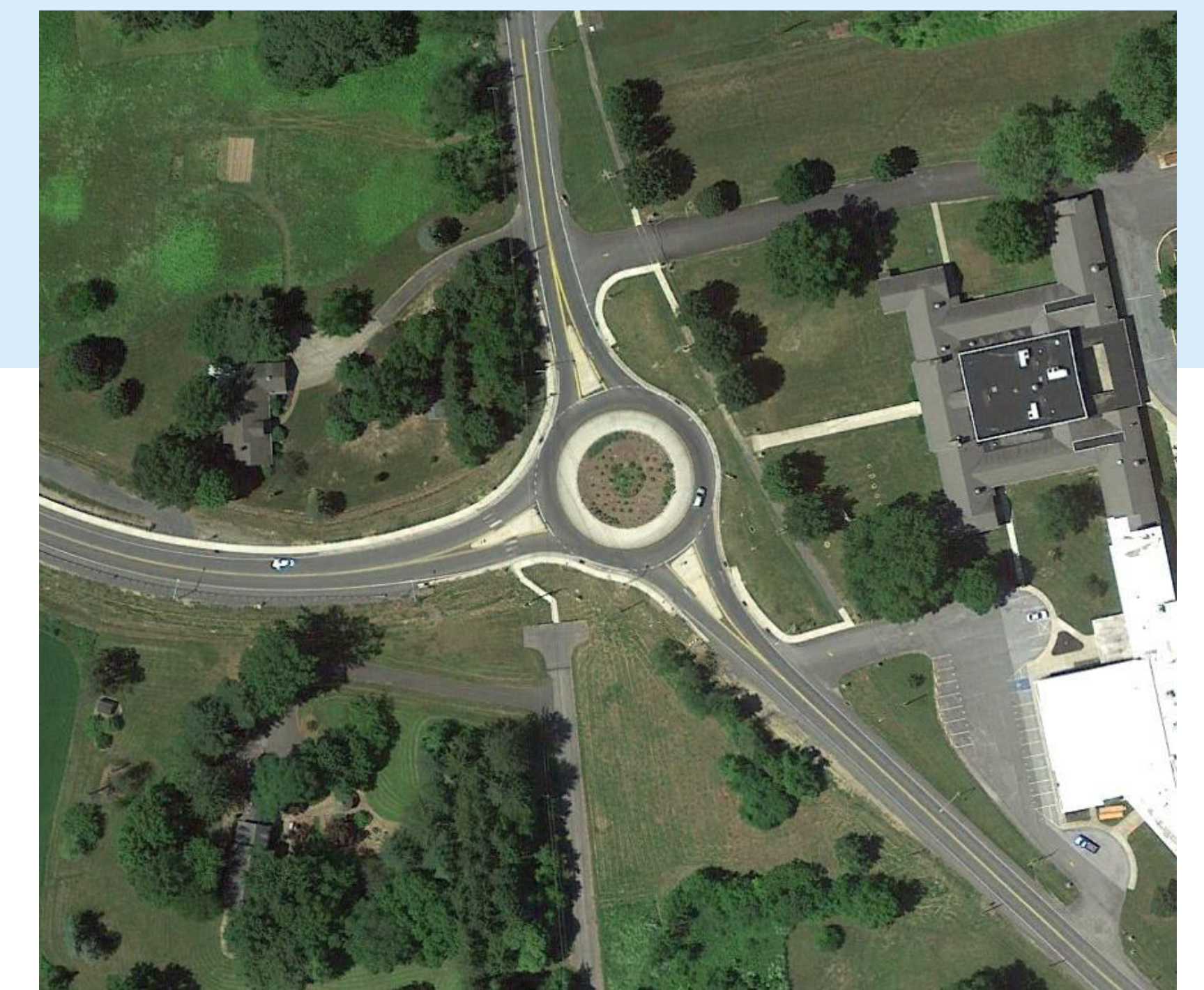
Mifflintown, Juniata County