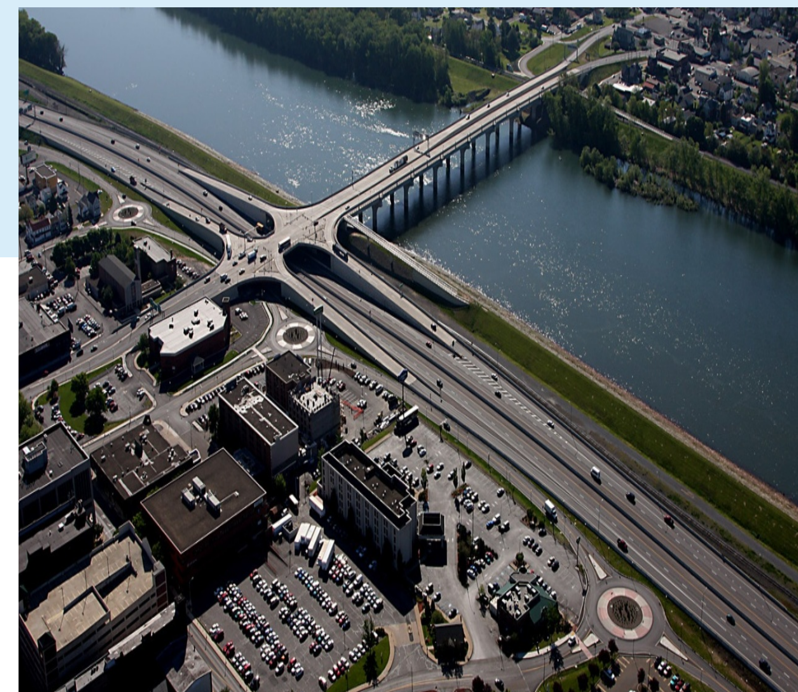
Williamsport, Lycoming County

If an emergency vehicle is about to enter or has already entered the roundabout, do not stop in the roundabout. Instead, exit out your original destination and then pull over.